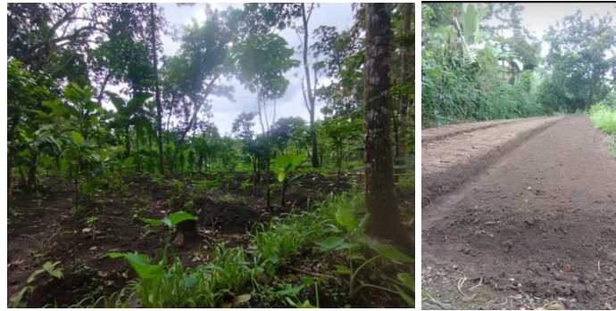
Figure 15. Sharing Land