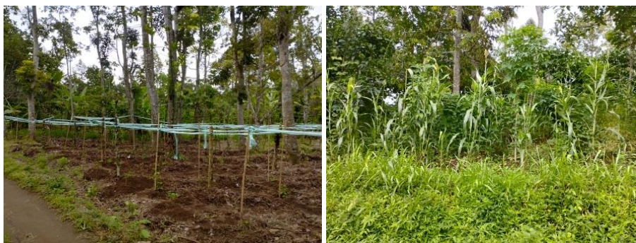
Figure 10. Corn and Cassava Planting

Forest areas close to mountainous areas provide high fertility to the soil. This positive value supports the implementation of a sharing system between Perhutani and breeders. Farmers will be given cultivated land in areas on the edges of protected forests and production forests to plant several horticultural plants (fruit and vegetables) and economically valuable secondary crops such as cassava, sweet potatoes, corn, and long beans. Breeders must also pay attention to forest sustainability. Breeders are required to plant and care for one main tree during the maintenance period and planting period for sharing land such as sengon , mahogany, saigondi provided by Perhutani and are prohibited from destroying or taking anything from forest plants such as leaves or wood that is still intact from the tree directly. This is intended so the forest area does not experience damage and can still benefit all parties, including the livestock community and Perhutani. Planting this plant certainly benefits breeders; the proceeds from the sale can be used for additional capital to develop their livestock or share payment capital to Perhutani is 70,000IDR/5 m 2 every year.