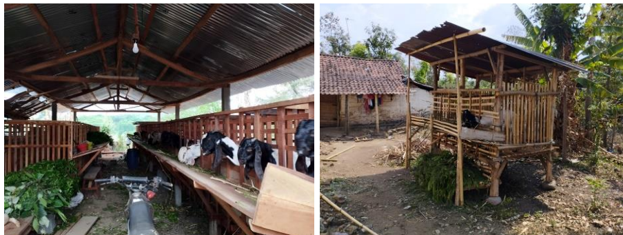
Figure 12. Development of Local Livestock

Animal husbandry in Besowo Village is becoming an option for businesses other than gardening and farming, although it is still used as savings for emergencies. As the years go by, the number of farms in Besowo increases and becomes more varied. The most significant development is in goat/sheep farming, with the number of goats increasing sharply from 2020 to 2022 by 100% from 1524 heads (Besowo Village Mapping Team, 2020) to 3106 heads (Besowo Village Data, 2022), while the number of sheep increased by 90% from 33 individuals (Besowo Village Mapping Team, 2020) to 322 individuals (Village Data besowo, 2022).