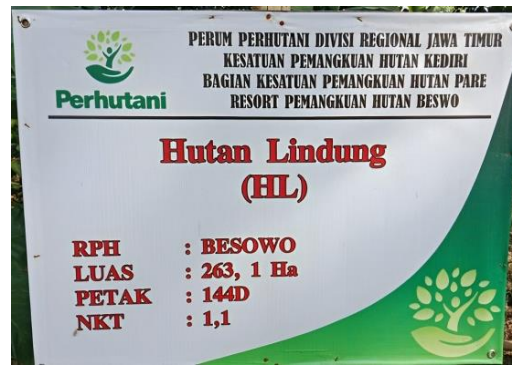
Figure 2. Protected Forest