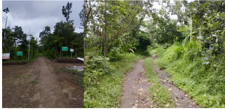
Figure 9. Road access to the forest