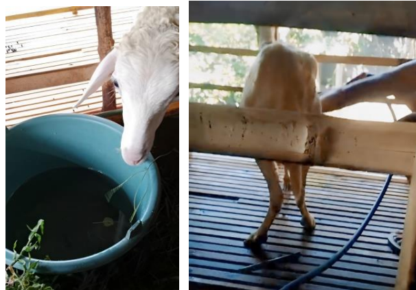
Figure 7. Water for livestock's drinking and bathing

Breeders use the existing water to bathe livestock according to the condition of their fur. Livestock with filthy fur will immediately be bathed and have their fur brushed to keep the livestock clean and avoid the emergence of disease. Local farmers also use the water to drink for livestock, which will be provided daily.