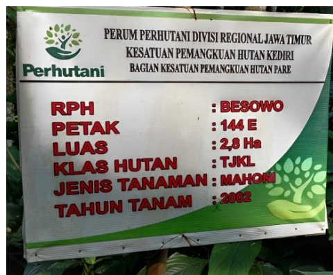
Figure 3. Production Forest

Production forests are areas helpful in meeting people's needs for forest products in the form of timber and non-timber, which have larger areas and are usually owned by private companies or local regional governments whose use is strictly monitored (Mustikaningrum, 2022). The production forest in Besowo has an area of 512.3 ha planted with several production plants, namely pine, sengon, Mindi, gembilina, mahogany, and jabon. Local breeders can use this area for farming due to a sharing agreement between Perhutani and breeders. Each party benefits. Farmers as actors can use the land to grow crops, with the results resold for additional capital for livestock development or reused plant remains as animal feed, while Perhutani, as the land owner, will receive a profit share in the form of money amounting to 70,000IDR/500m 2 every year and assistance to maintain and protect the central plants (teak, mahogany, sengon, gembilina and salam) planted on the land.