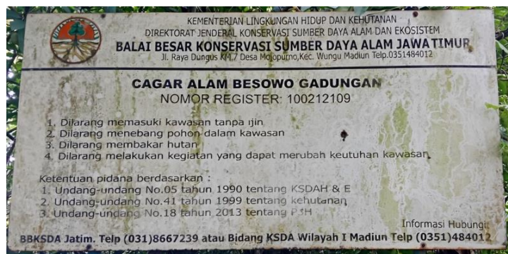
Figure 4. Besowo Nature Reserve