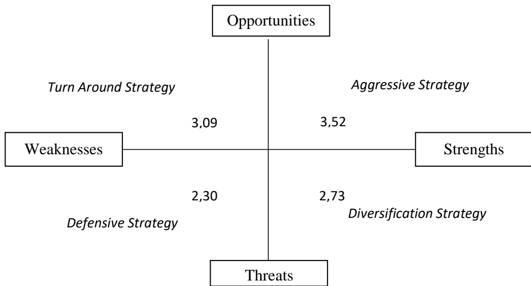
Figure 17. SWOT Analysis Diagram Source: Primary data processed (2024)

Based on the SWOT analysis diagram, it can be concluded that the strategy for utilizing forest resource to develop practical goat/sheep farming is the SO (Strengthens & Opportunities) strategy. The SO strategy is carried out by optimizing strengths to take advantage of existing opportunities to aggressively support the growth of something (Riantoro & Aninam, 2021). The SO strategy position in quadrant 1 is profitable because it has the power to take advantage of existing opportunities so that implementation of this strategy can be carried out easily (Rangkuti, 2005; Widyanto et al., 2012). An analysis of internal and external factors in using forest resource to develop goat/sheep farming in Besowo Village found several alternative strategies, as shown in Table 10.