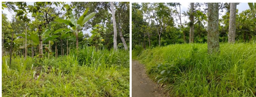
Figure 8. Forest Resources Types of Grass and Timber

gembilina and basalt. The Besowo Village Mapping Team (2020) also added that other types of local vegetation that are often found in the Besowo Forest are acacia, banyan, bamboo, flamboyant, kluwer , rau , rattan, guava , rete , kedondong alas , and cembrit . The many types of plants are potential commodities for use as animal feed. Farmers will encroach and take leaves and grass from the forest for animal feed. Collection is carried out every morning and evening with the amount adjusted to the number of livestock owned. Forest plants are used as feed to reduce feed costs because feed contributes to substantial production costs, namely 60-80% of the total costs of livestock businesses (Nursida & Susanto, 2017).