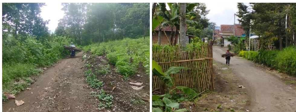
Figure 16. Wood Collection by Farmers

In general, the people of Besowo Village have long used forest areas as a source of livelihood, either in non-timber forms such as grass and secondary crops or in the form of wood. The wood taken by the community consists of fence wood and large wood. This week, wood will be used as firewood for cooking, while large wood will be used as material for repairing and expanding livestock pens. Some types of wood that people often take are teak, mahogany, sengon, gambili, gambilina, basalt and salam. This wood collection is only permitted for dry wood falling to the ground, not wood still standing straight from the tree. However, the problem is that there are still cases of wood theft by irresponsible parties carried out secretly so as not to be discovered by guard officers (Azizah et al., 2024).