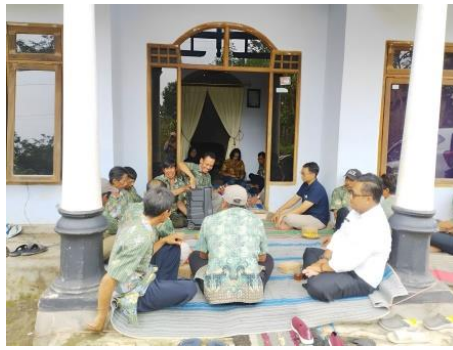
Figure 13. Rojomulyo Farmers Group