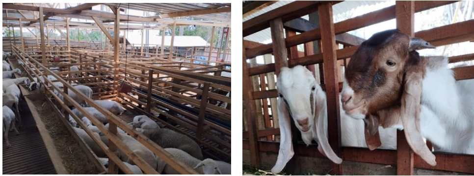
Figure 5. Goats and Sheep in Besowo Village

Livestock businesses in Besowo Village usually include broilers and beef cattle, but goats/sheep dominate livestock businesses in Besowo. The nature of livestock farming in Besowo is small farming with ownership of under 10 sheep/goats and is a side business because most breeders are also farmers/farm laborers. This business has experienced an increase in quantity starting from 2020 and 2022. Data on the number of livestock kept is presented in Table 2.