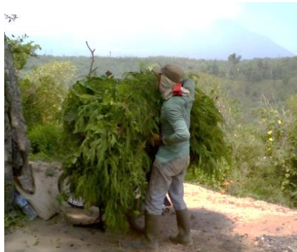
Figure 6. Farmers collect grass from the forest

also use the edges of the shared land to plant several animal feed plants such as odot or elephant grass. This is by the opinion of Suryanto (2019) that this agroforestry system has several benefits, namely improving the quality of soil and water, increasing forest resilience in supporting river watersheds (DAS), providing livestock with shelter and feed, and maintaining the necessary land resources both for human and livestock needs.